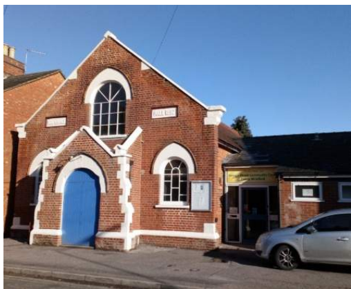
Fenny Stratford Community Centre

On 1 January 2021, the Town Council took over direct management of Fenny Stratford Community Centre when a previous lease ended. Historically this building has been a hub of community activity since its early days as a Temperance Chapel. The Town Council wants to continue this tradition. We are planning for FSCC to be a vibrant and attractive space which is available for different activities and enjoyed by a wide cross section of the local community.