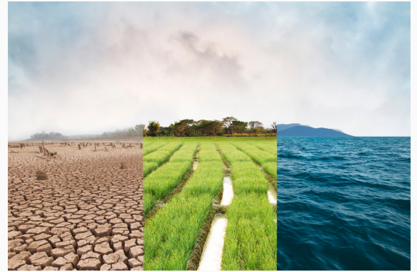
Working towards climate neutrality

Early in 2020 the Town Council declared a climate emergency and resolved to work towards carbon neutrality in our area 2030. Unfortunately, the development of the planned Climate Action Group and Action Plan has been delayed by the impact of Covid-19. Despite this setback the Town Council has concerned itself with environmental and climate change issues during the year particularly its continued opposition to the potential extension of the Bletchley Landfill Site at Newton Leys. The Council remains committed to working with Milton Keynes Council, other parishes and community groups to achieve our climate change objectives.