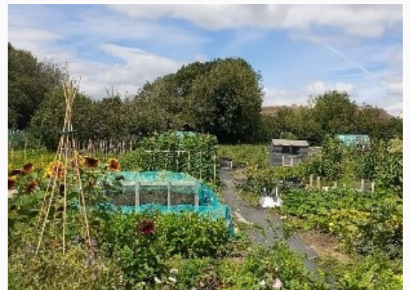
Manor Field Allotment

Specialist work was undertaken at the Community Orchard in February 2021 to replace tree guards, perform restorative pruning of fruit trees and planting of new stock. Ongoing maintenance work at the allotments took place throughout the year.