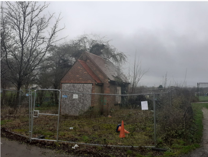
Pump House before

In March 2021, the Town Council demolished its former storage facility at Manor Road. The building had not been used for its intended purpose for some years and it is now hoped to provide a more attractive green space in this location which will not be so appealing to vandals. The Town Council, working in partnership with Milton Keynes Council, co-funded outdoor furniture at the Library and new benches at the War Memorial in Queensway.