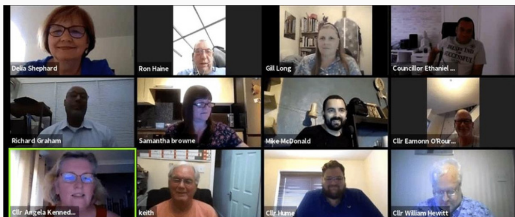
Online Town Council Meeting

Since May 2020 all Council and Committee meetings have been held via video conference call in line with the Local Authorities and Police and Crime Panels (Coronavirus) (Flexibility of Local Authority and Police and Crime Panel Meetings) (England and Wales) Regulations 2020. Meetings have been live streamed either on Facebook or YouTube and members of the public have had the opportunity to participate online and to watch meetings live or at a later date. Whilst this has not been ideal for some, community engagement with different groups has increased through this use of digital media. In 2019-2020 the Town Council had taken the decision to move to paperless meetings and Councillors adapted to virtual meetings and use of computer tablets for reports as the year progressed. The Town Council had also invested in an IT infrastructure which enabled most employees to work from any of the Town Council's premises or from home. These arrangements greatly facilitated good governance throughout the year. Members have been determined to follow government and health and safety guidance throughout the pandemic and to encourage all residents to do the same. All amendments to services, procedures and activities were made with careful thought and thorough risk assessment.