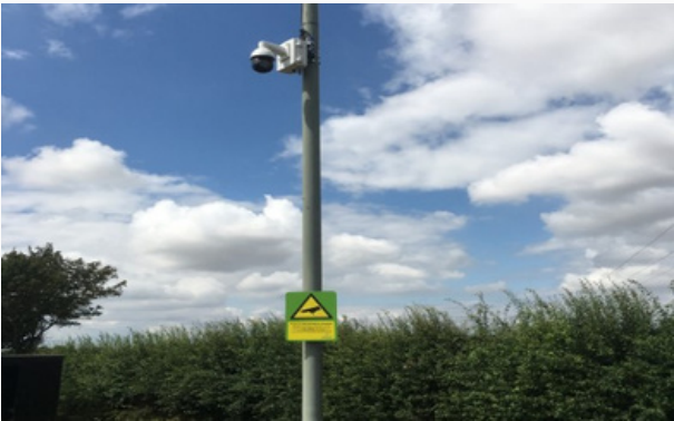
CCTV in use

Community Safety remains an important issue in Bletchley and Fenny Stratford and the Town Council has continued to provide CCTV cameras which were deployed in locations across the area where Thames Valley Police had identified a need. This resulted in identification of individuals and a number of interventions including arrests.