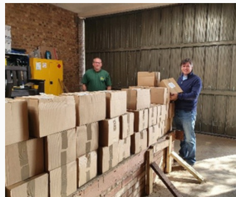
Preparing for the Community Larder

The Town Council responded to the Covid-19 pandemic in several ways including delivery of Sofea food parcels in partnership with Water Eaton Church. Over 100 boxes per week were delivered to residents between April and September 2020 when this scheme came to an end. Building on this successful partnership the Town Council again collaborated with the church to launch the Water Eaton Community Larder. This not only provides good food at a good price but also helps avoid food surplus going to landfill. We also collaborated with other partners such as local Family Centres, Age UK, public health and MK Council and others to support families and individuals in need and to help them access services. The support of community volunteers has been invaluable in helping us to help residents.