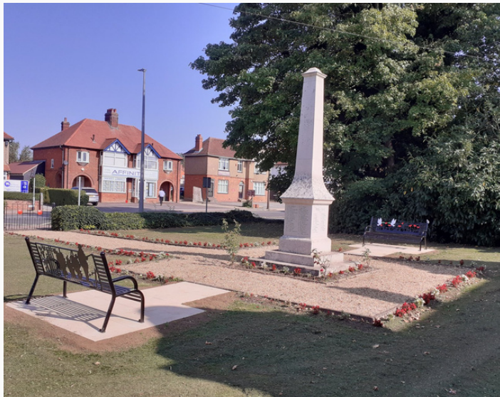
New Benches at the War Memorial