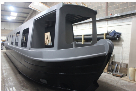
Electra under construction

The Town Council supported the work of the Bedford and Milton Keynes Waterway Trust to commission the Electra, an all-electric, fully accessible 12 passenger community boat with a £2,500 grant. In addition, the Town Council has entered into a three year partnership with the Waterway Trust aimed at enhancing the canal side in our area.