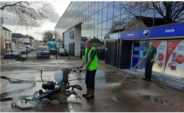
Rangers in Queensway