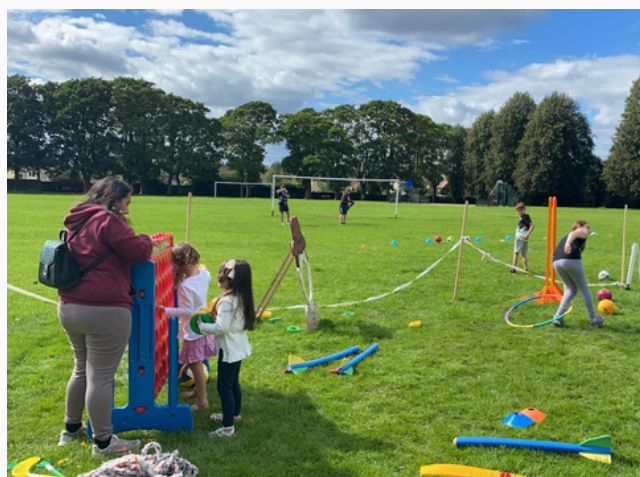
Play session delivered by MK Play Association 2020

The Town Council has also allocated grant funding to charities working in our area to meet community needs. This year this has included organisations working to help children and families with life limiting conditions and provision of housing for young people.