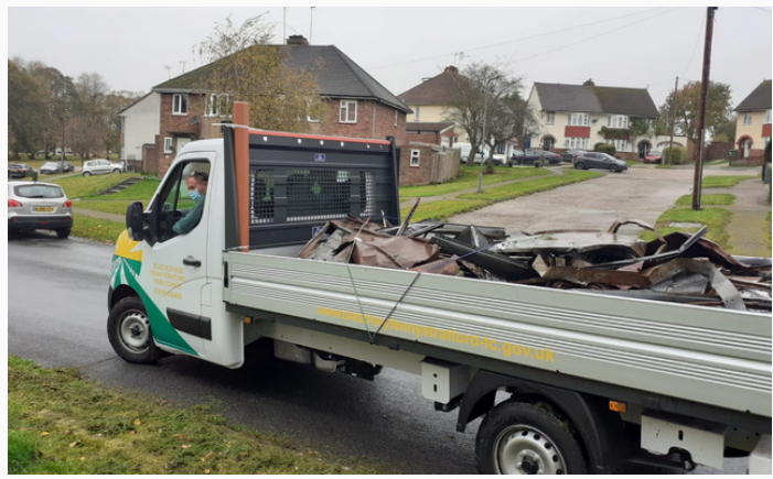
Town Council Van

In March 2021, the Town Council demolished its former storage facility at Manor Road. The building had not been used for its intended purpose for some years and it is now hoped to provide a more attractive green space in this location which will not be so appealing to vandals. The Town Council, working in partnership with Milton Keynes Council, co-funded outdoor furniture at the Library and new benches at the War Memorial in Queensway.