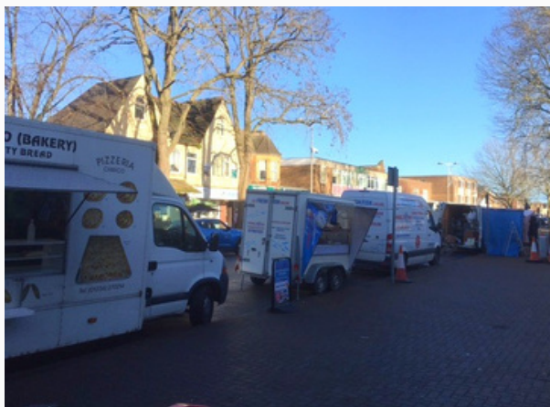
Bletchley Market Stalls

It has been a difficult year for Bletchley Town centre especially for retail business. Following the lifting of the first Covid lockdown social distancing measures were introduced by Milton Keynes Council (as Highways Authority). These were designed to promote community safety and included a partial road closure in Queensway. The location of market stalls was also changed as part of this scheme. These measures were not popular. The Town Council advocated for changes which were negotiated with Milton Keynes Council. Many residents did not understand that the Town Council does not own any land in Queensway, operates market stalls under a licence from Milton Keynes Council and has no highways powers. Parking in the Town Centre also generated many complaints this year and the Town Council has continued its ongoing representations to Milton Keynes Council to try to achieve improvements. Despite these problems a small core of loyal market traders continued to trade when permitted and it is hoped to build on this. The Town Council reviewed its provision of public conveniences in Albert Street committing to undertake public consultation on this service in the year ahead. It is hoped that the Town Investment Plan of the Bletchley and Fenny Stratford Town Deal will result in changes to the public realm in Bletchley and Fenny as well as to other projects.