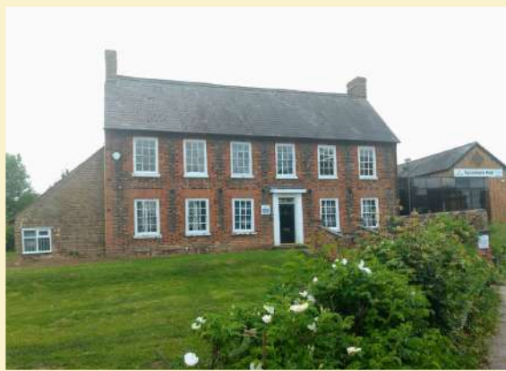
Sycamore House, Drayton Road, Water Eaton, MK2 3RR