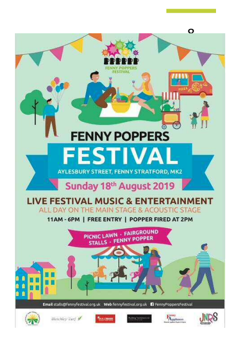
Grant funding will be available again in 2020-21 and details about how to apply and the grant criteria can be found on our website.