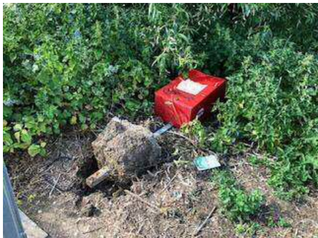
Figures 14 & 15 Essential Maintenance