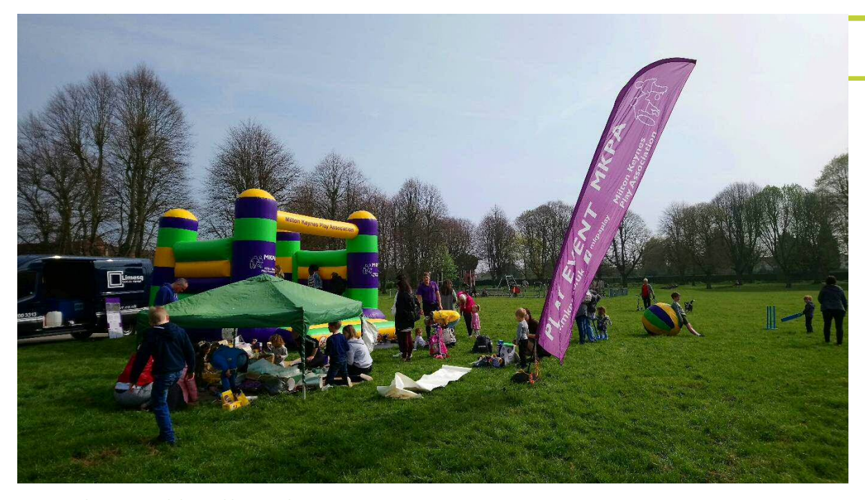
Figure 7 Play session delivered by MK Play Association 2019