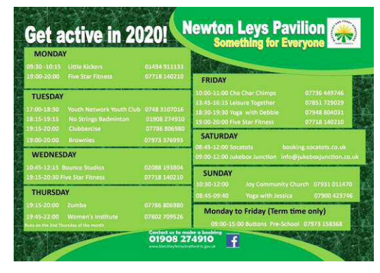
Figure 21 Newton Leys Pavilion Timetable 2020

Work around the parish continued in other ways including the continued success of the Newton Leys Pavilion and an increasing number of activities taking place there.