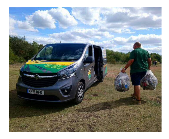
Figure 1&2 Litter pick at Blue Lagoon

Community Litter Picks were very successful throughout the year and a great sense of achievement was had by all!