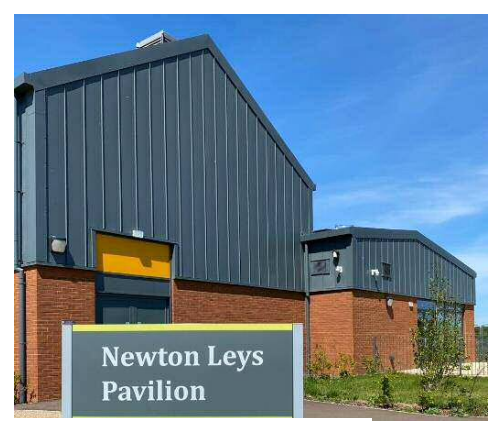
Figure 20 Newton Leys Pavilion

Work around the parish continued in other ways including the continued success of the Newton Leys Pavilion and an increasing number of activities taking place there.