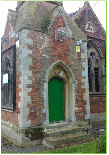
Figure 3 Manor Road Cemetery Chapel

The current phase of work on the cemetery chapel at Manor Road was completed in June 2019. The building is currently being used for storage purposes until a long term community use can be identified.