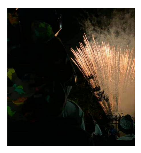
Figures 16, 17, 18 & 19 Examples of grant recipients