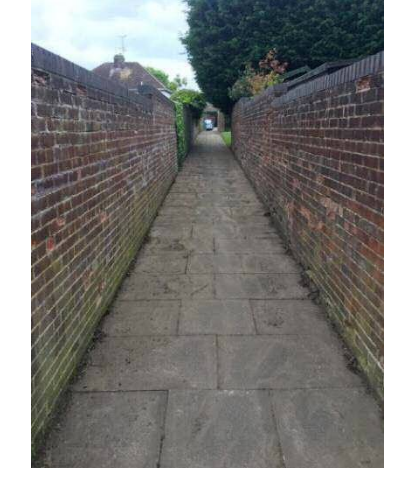
Figures 11, 12, 13 Clearing alleyways