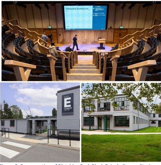
Figure 9. Regeneration of Bletchley Park Block E, including auditorium.

In October 2023, Bletchley Park Trust held an official launch event to show us the newly renovated transformation of Block E. This project has positively regenerated this space, providing new educational facilities and an incredible auditorium which will be used to help upskill students.