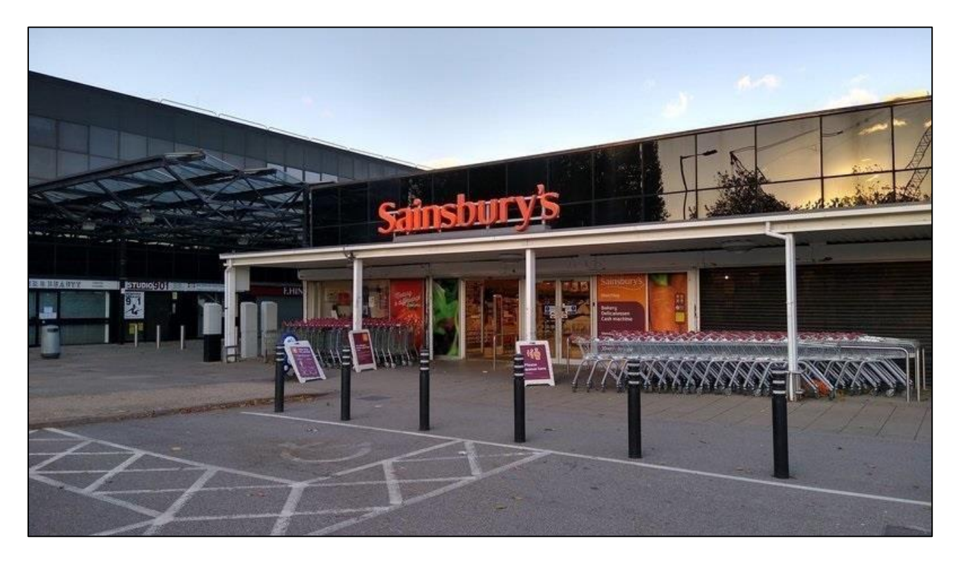
Figure 4. Sainsbury's supermarket - acquired by Milton Keynes Development Partnership in February 2023

In February 2023, the Revolving Development Fund was used to purchase the former Sainsbury's site. This alongside the already acquired Brunel Centre, will enable the delivery of a high-quality mixed-use development, providing new housing (including affordable units), employment space and leisure use. The programme team are currently consulting on the Brunel Centre redevelopment brief and demolition of the Sainsbury's site is expected in the new year.