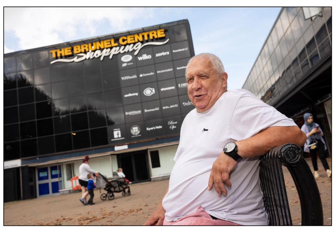
Figure 3. West side of Queenway, facing the Brunel Centre (Summer 2023)

To keep up to date with the Town Deal and latest news visit <a href="Home | Groundbreaking">Home | Groundbreaking</a> Bletchley and Fenny Town Deal (https://groundbreakingbletchleyandfenny.co.uk/)