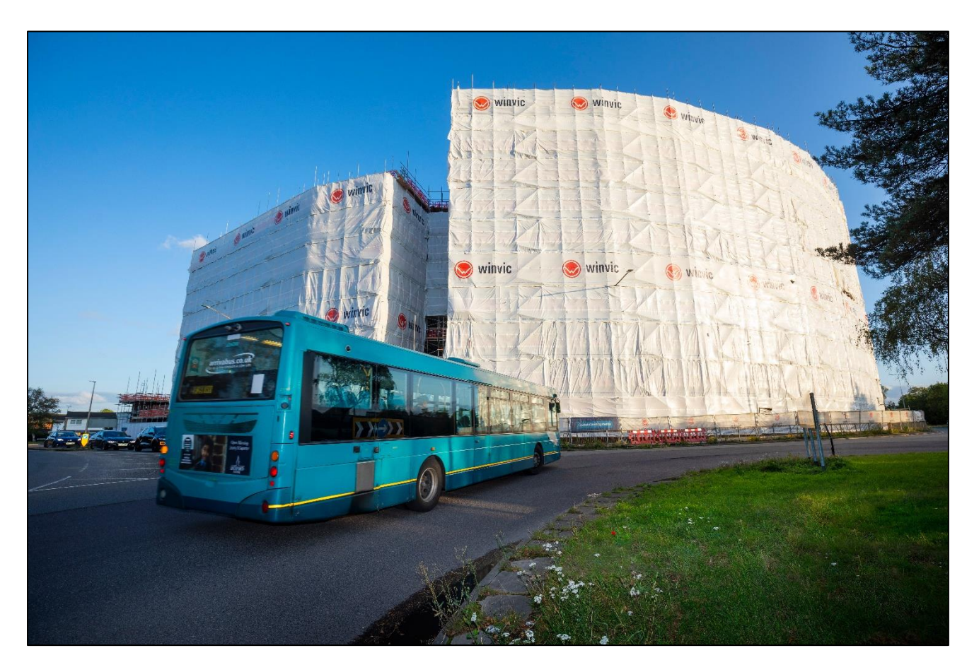
Figure 5. Bletchley View Housing Development, located near Saxon Street.

The Transport Hub scheme continues to explore options for remodelling Saxon Street and creating an ambitious gateway into Bletchley. In addition, conversations are ongoing with Network Rail to identify additional opportunities that this development may bring, including the long held ambition of delivering an eastern entrance to the train station. Whilst there are no firm agreements in place, we will continue to work with partner organisations to deliver a scheme that helps capitalise on the opportunities East-west Rail provides and act as a catalyst for the wider regeneration of Bletchley.