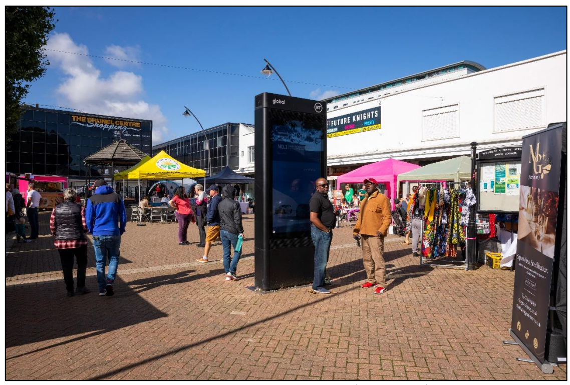
Figure 1. Community Event on Queensway (Summer 2023)

Before we delve into the ongoing regeneration of Bletchley & Fenny Stratford through the Town Deal programme, we must highlight and celebrate the wider achievements that the area can reflect on.