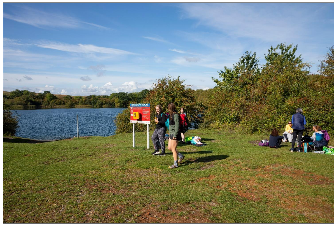
Figure 2. Blue Lagoon (summer 2023)

We look forward to continuing working with stakeholders to help regenerate Bletchley & Fenny Stratford.