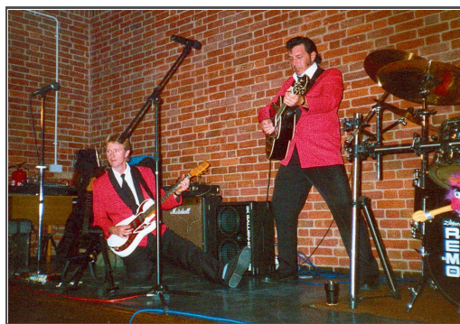
The Rockets play Sycamore Hall 2002 - Bletchley School 1953- 56 reunion.

Though the two buildings are physically separate, the community building was the home of the Sycamore Club and provided a venue for various community and social activities. Many residents will remember attending wedding receptions, parties, awards ceremonies, sports activities and even pre-school in the building.