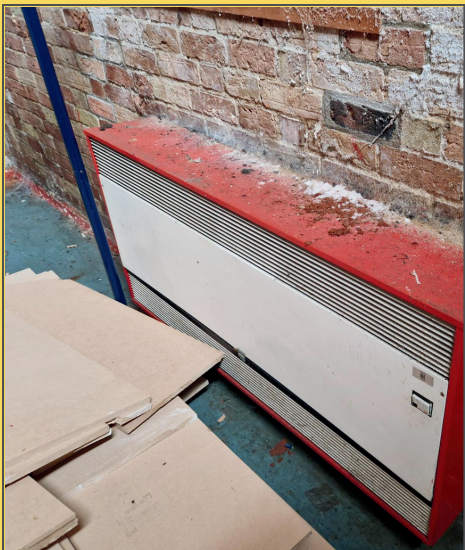
Extensive renovation work is still required to make Sycamore Hall fit for the future.