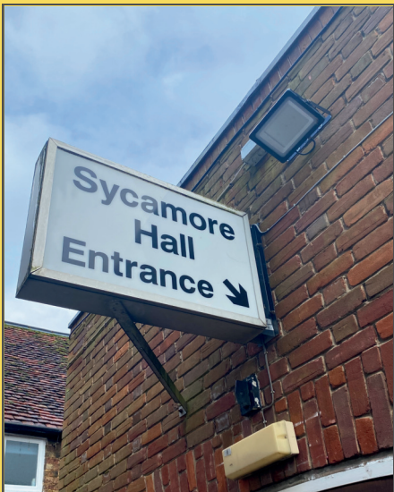
We believe Sycamore Hall can once again be a thriving venue at the heart of our community